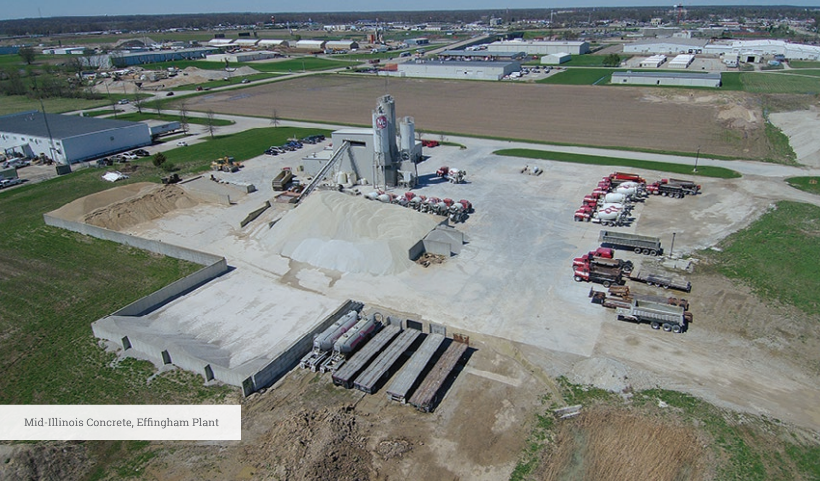
Mid-Illinois Concrete, Effingham Plant