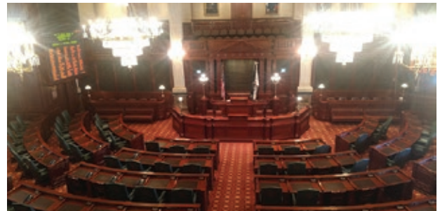
The Illinois House Chamber is located in the south wing of the third floor of the Capitol.