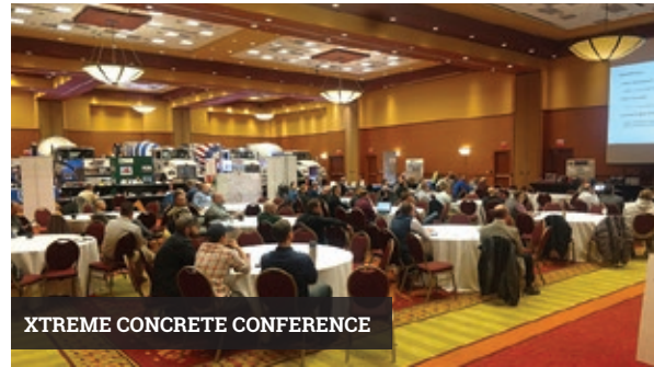
XTREME CONCRETE CONFERENCE