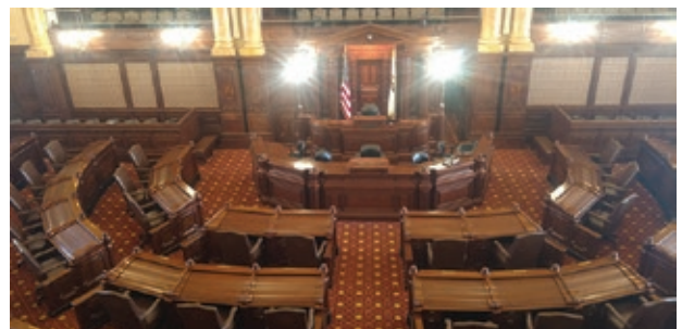
The Illinois Senate Chamber is located in the north wing of the third floor of the Capitol.