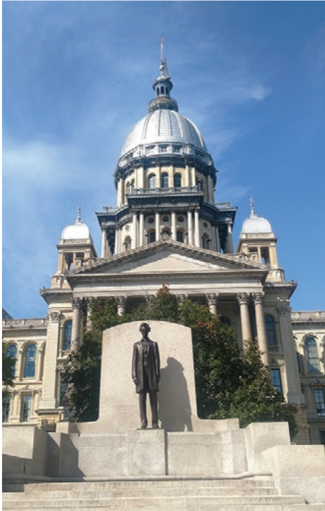
This statue of Abraham Lincoln stands at more than 10 feet tall and greets people approaching the Illinois State Capitol from the east. It was sculpted by Andrew O'Connor and dedicated in 1918.

letting much needed future projects. IDOT will begin with maintenance and repairs as a priority. Most projects will begin to happen in 2020. These new funds will also provide money at the county and municipal levels. IRMCA will be proactive with our governmental agencies by promoting the use of concrete in their projects.