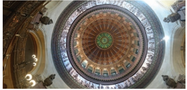
The Capitol dome contains beautiful stained glass. The dome was restored in the 1980s.

IRMCA and Transportation for Illinois Coalition worked together for more than two years on the Capital Bill and lobbied to repeal the Commercial Distribution Fee (CDF), which will lower your license fees by $400 per truck at your next renewal.