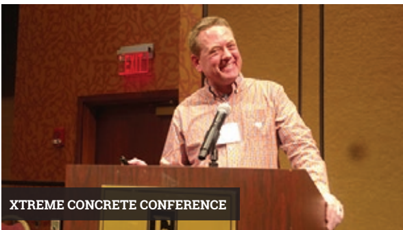
XTREME CONCRETE CONFERENCE